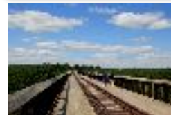
Kinzua Bridge Skywalk