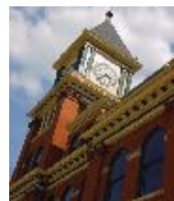
Bradford Historic District

Largest City: Bradford 5 minutes from PA/NY state line