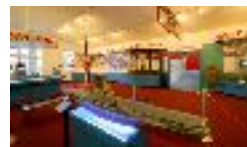
Eldred WWII Museum