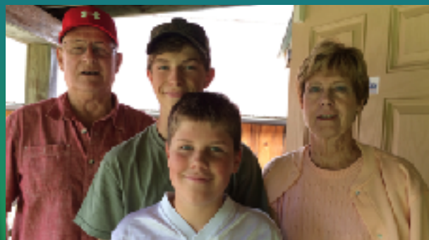
Family Fun for All Ages