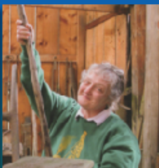
Expert Guided Tours