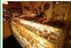
John Williams European Bakery

Penn Brad Oil Museum 901 South Avenue Bradford, PA 16701 814 362-1955 814 366-3985 pennbradmuseum@icloud.com