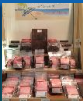
Unique Gift Shop