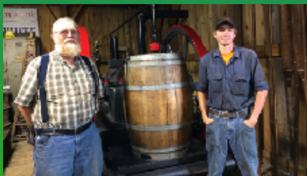
Oilfield Engines that Actually Operate