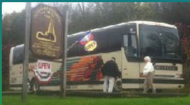
Bus and Group Tours