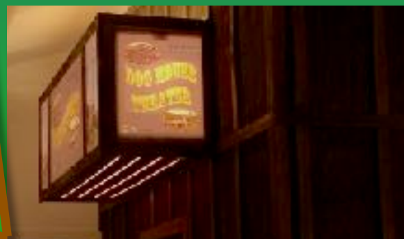
Historical Movies in the New Theater

You might include in your trip to Bradford, Pennsylvania: