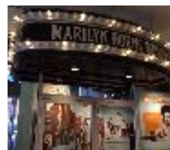
Marilyn Horne Museum